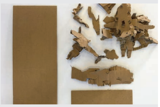
20-30% increased filling capacity of containers