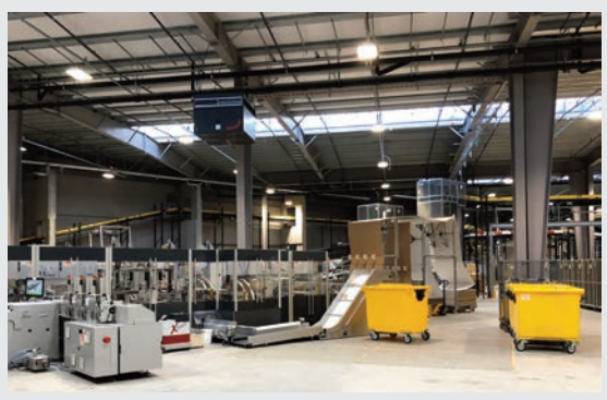
Less space is required