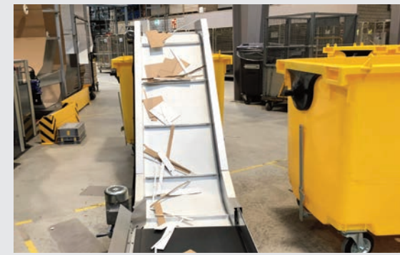
Nonstop production without container change