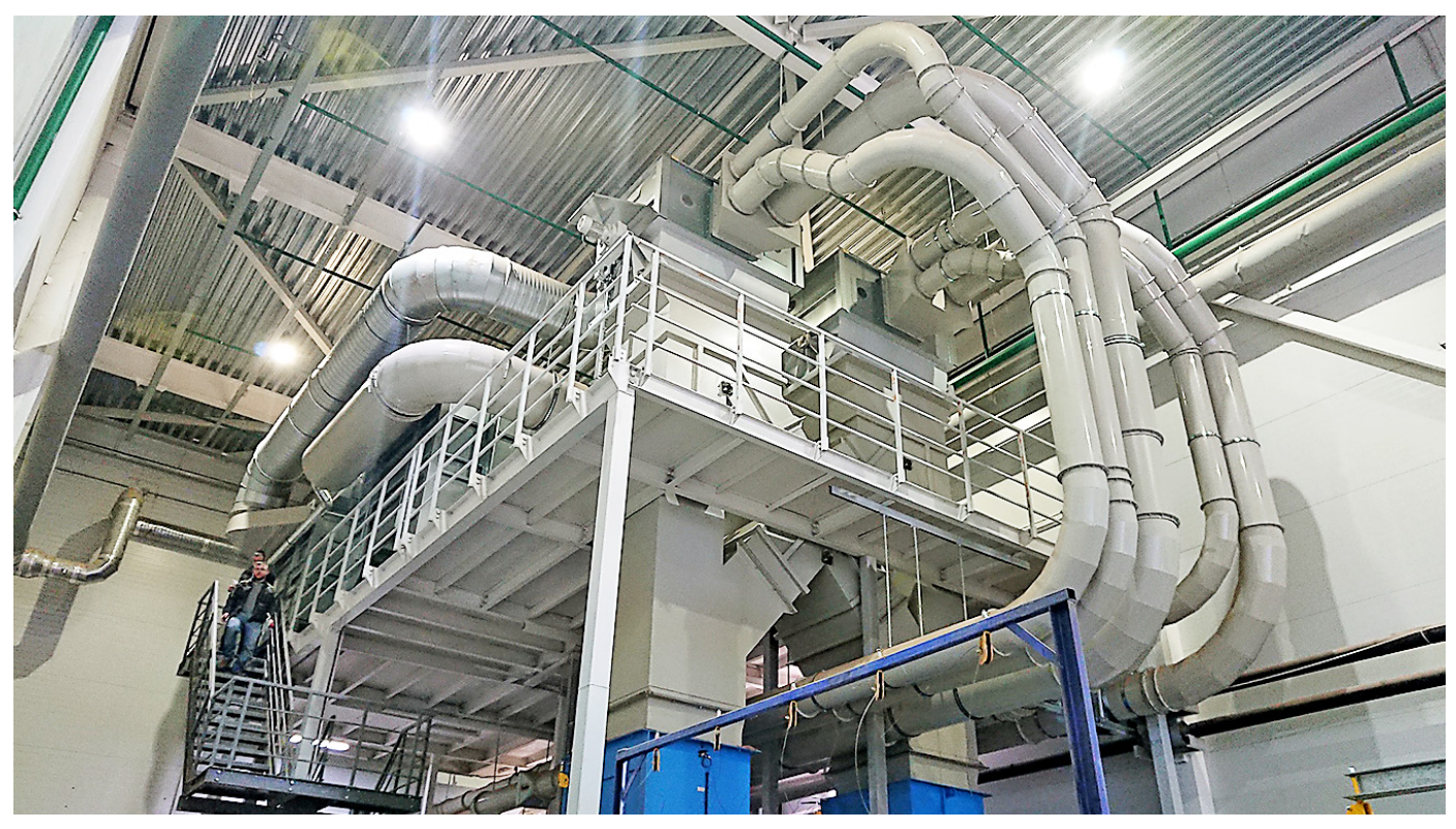
As the extraction and compaction plant is installed on two levels, optimal use of the available vertical space is made.

vironment. Hunkeler Systeme AG, with their negative pressure principle and the jet-filter technology, had good arguments on their side.