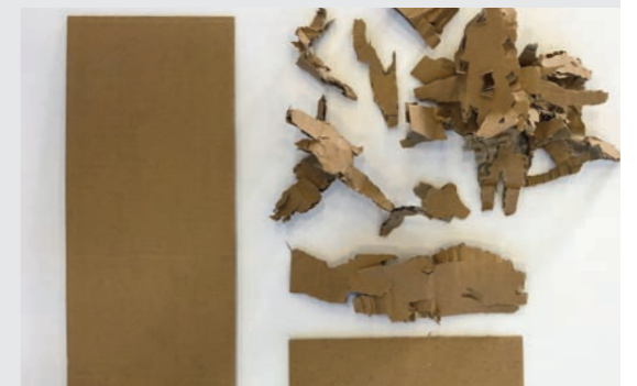
20-30% increased filling capacity of containers