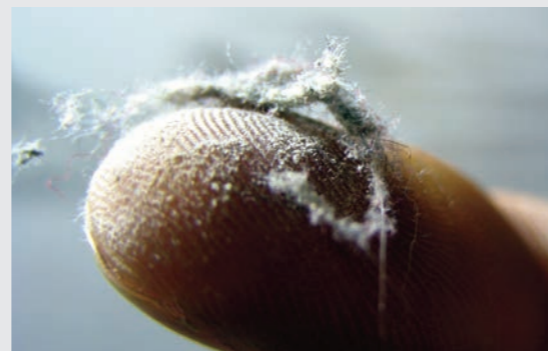
Cleaner production area