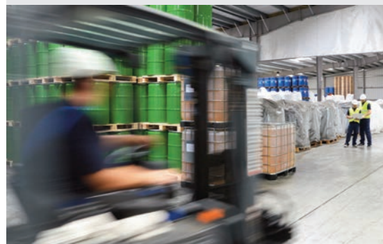
Reduction in labor cost