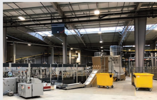
Less space is required